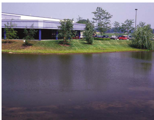
Without True Blue

Lakes and ponds look best when they are clean, clear, and naturally pleasing. True Blue lake and pond dye is a proprietary blend of water-soluble dyes formulated to reduce sunlight penetration and impart an attractive blue coloring to natural or man-made ponds, water hazards, lakes, and fountains. True Blue is safe and non-toxic to fish, birds, and animals. True Blue EZ SoluPaks make application even easier, with pre-measured individual dosage packs in a convenient water-soluble packaging.