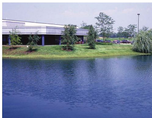
With True Blue